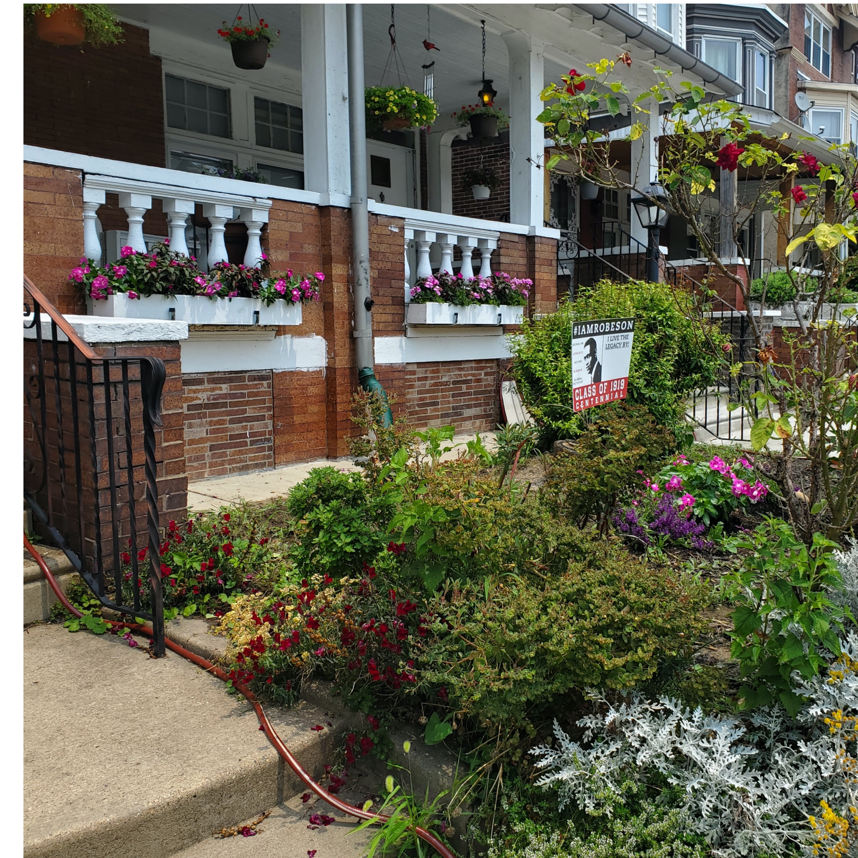
Garden Space at the Paul Robeson House

UC Green is a nonprofit organization started in University City with a mission to improve the West Philadelphia neighborhoods and promote a greener Philadelphia with its motto "Trees make great neighbors." The founding vision was for UC Green to be the bridge that fosters connection between community organizations, city agencies, university students, and residents on local environmental efforts. This is accomplished by the organization's efforts to empower volunteer environmental stewardship among community members through partnerships, such as with Bartram Gardens and Holly Street Neighbors Community Garden, and educational initiatives. UC Green also coordinate community engagement projects and addresses barriers residents have related to greening and tree planting. While the organization is operating with both in-person and remote operations due to COVID-19, UC Green remains active in supporting the growth and prosperity of West Philadelphia.